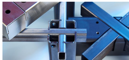
The TruLaser Tube 7000 cuts tubes and profiles with outer circle diameters of up to 254 millimeter. Complex calculations at corners of rectangular profiles are automatically handled by the TruTops Tube software. Picture: