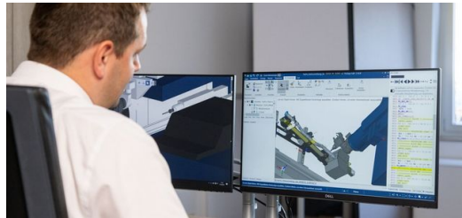
<p class="MAGAFietext">..... TecPro ..... ..... </p>