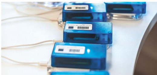
<p>Prototype: What the markers looked like during the test phase.</p> – Niels Schubert