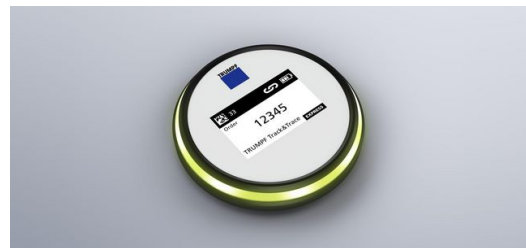
<p>Marker: Users can transfer the order number and other information digitally onto the e-ink display of the marker. They can then simply place them on or beside the parts of the order.</p>