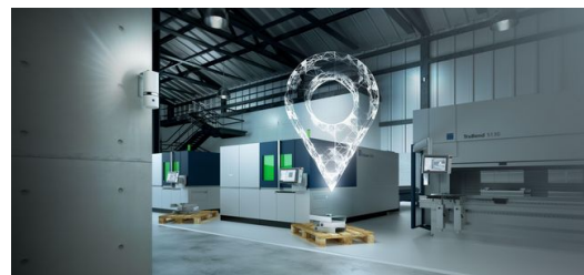
<p>This enables sheet-metal manufacturers to track orders, load carriers and means of transport and thus optimize processes.</p>