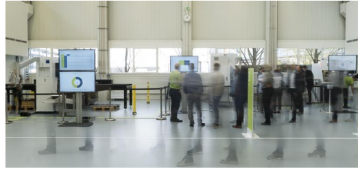
In the Showroom, employees produced a sheet metal part live. Screens displayed important manufacturing information.