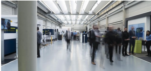
Visitors also crowded to the 2D laser cutting machines.