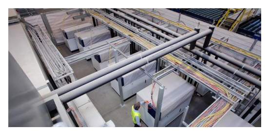
Zwölf Hochleistungslaser erzeugen 144 Kilowatt Leistung.

At the Glasstech 2016 trade fair in Dusseldorf, Saint-Gobain introduced SGG ECLAZ: a new generation of thermally insulating glass for double and triple glazing, which offers not only high light-transmittance values but also 20 percent higher energy efficiency compared to similar glass. A satisfied Lorenzo Canova adds: "Thanks to the new process, we are in a position to create brand-new products."