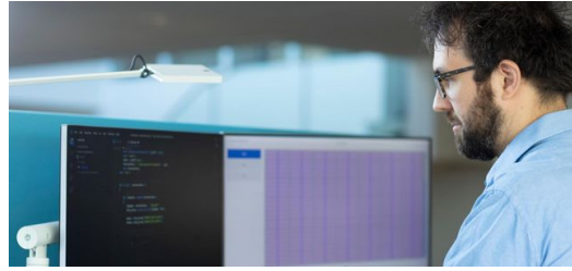
IT specialist Raphael Willgenss deliberately opted for an open ERP system: "I programmed many of the optimizations in the upstream and downstream processes myself."