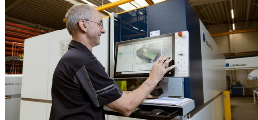
A TruLaser 3030 is loaded and unloaded semi-automatically with a LiftMaster.