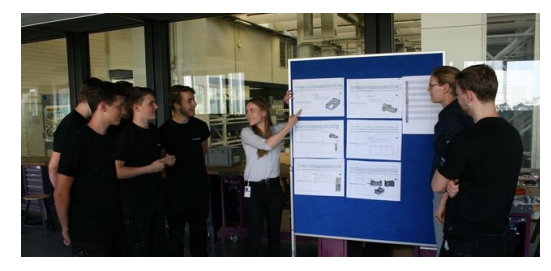
The idea is to actively involve 170 students and apprentices from different departments in the project over the next three years, and to accompany them on that journey.