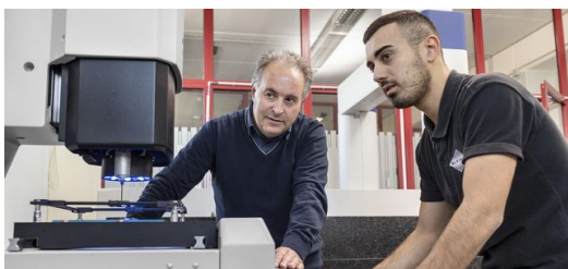
Replacement parts for classic cars are rare. Using the LMD process, they can be reconstructed in a cost-effective way. In such cases experts at ELFIM