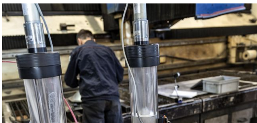
In combination with a powder feeder, the LaserCell 1005 from TRUMPF is also highly suitable for laser metal deposition.

“Strictly speaking, LMD is actually nothing new. It’s a process that has been used for many years now for repairs and coatings. However, we decided to use the process for manufacturing complete components – as is the case with this impeller here.”