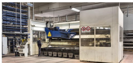
Multi-talented: ELFIM does not just use the LaserCell 1005 to weld and cut 2D and 3D components. The system is also suitable for laser metal deposition.