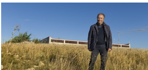
The company ELFIM s.r.l. is situated on a bleak and desolate limestone plateau near Gravina in Puglia.