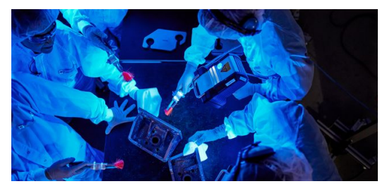
Most of the system is disassembled and cleaned in order to remove any microscopically small particles before being dispatched. Such contamination could prevent the laser from operating correctly at the customer's site.