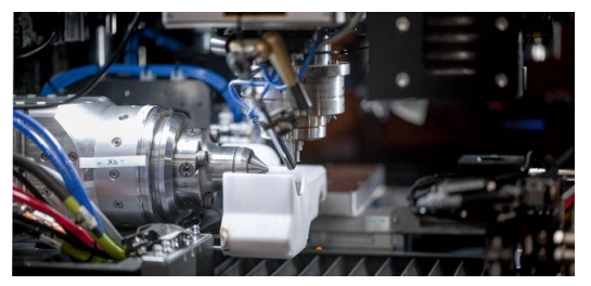
The principle of laser rotation: (to the left) the air-bearing rotational axis that holds the workpiece; the trepanning unit works from above. The workpiece rotates at a speed of 3,500 rotations per minute, where the focus circles are 30,000 times per minute.