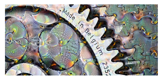
The dream in the workpiece?

Lasers also score highly on their ability to capture vast quantities of data using a whole host of sensors—data that is steadily becoming more and more valuable. Algorithms trained on the basis of human experience can constantly detect new patterns in this jumble of information, invisible to the human eye, and then use these patterns to draw conclusions. Researchers worldwide are developing these kinds of Al systems right this second. And the results will gradually improve not just laser material processing, but also lasers themselves. Much like today's chess players, laser users a decade into the future will be the best laser users of all time—and they will have learned to love their Al.