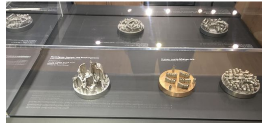
Substrate plates with 3D-printed dental prosthesis.