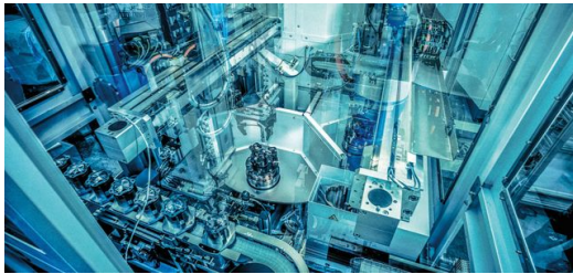
Intelligent production means: the machine finds out for itself what to do.