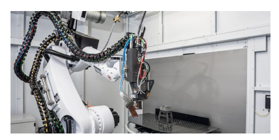
The laser network, serving a TruLaser 3030 ber and a TruLaser Robot 5020, expands the range of services offered by SCS by adding laser cutting and welding.