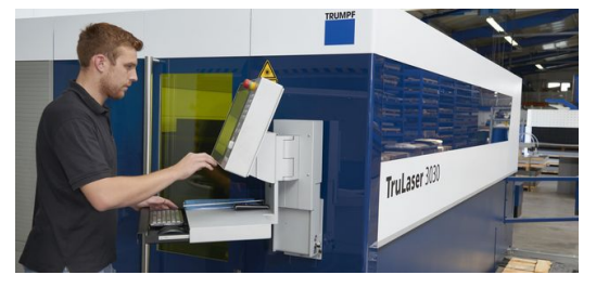
Christoph Siegl is particularly impressed by the Drop&Cut function, an unrivaled solution for quick post-production.

In spite of the fact that another machine tool manufacturer was close by, the Sigels traveled to the TRUMPF show room in Ditzingen. The quality of the specimen parts was just as convincing as the rugged engineering of the TruLaser 3030 fiber. "The machine is really made for shop use. Every detail has been thought out entirely," acknowledges Christoph Sigel. "I was particularly impressed by the Drop&Cut function, an unrivaled solution for quick post-production." Drop&Cut uses a camera to transmit a live picture of the machine's interior right to the display at the control terminal. A mouse click or touching the screen is su=cient to project the geometry of the desired part onto the remaining plate. Parts can be positioned and turned, inside the camera's field of view, on the sheet metal. Here outlines can be rotated, shifted, copied or deleted as desired. Christoph Sigel: "Post-production couldn't be any easier."