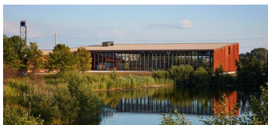
Chicago was consciously chosen as the location for the Smart Factory of TRUMPF. The directly adjacent states contain around 40 percent of the country's entire sheet metal working industry.

“Our customers in Chicago can witness a connected fleet of machines capable of processing orders automatically. The heart of the Smart Factory is a series of interconnected machines, many of which are linked to a STOPA high-bay warehouse. The entire production process is controlled by digital solutions that also always ensure transparency, e.g. with respect to order status or stocks of materials. In short, our Chicago facility provides customers with a live demonstration of the advantages of digitally connected manufacturing solutions, not to mention the future of sheet-metal processing.”