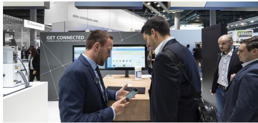
All 3D printers at the exhibition stand were connected to a digital MES

learn how much it will cost to produce the component and how long delivery will take. On top of that, the manufacturer can access the printers and the pending jobs' process data from anywhere in real time.