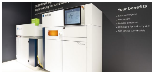
TRUMPF prints copper and gold with a new green laser

For another first at Formnext, TRUMPF printed pure copper and gold using a green laser. The company's developers achieved this by linking the new TruDisk 1020 disk laser and TruPrint 1000 3D printer. The former's wavelength is in the green spectral region, and unlike infrared lasers, it is able to weld highly reflective materials such as pure copper and gold. None of the expensive material goes to waste, which the jewelry industry is sure to appreciate. And the electronics and automotive industries benefit from components made of pure copper, an excellent conductor of electricity and heat.