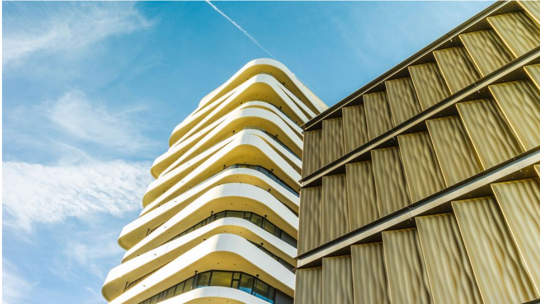
Multistory parking garage in Bietigheim-Bissingen

“Lasers are fast and flexible. We can use our systems for so many different things because they are so quick to reprogram,” says Geiger. TRUMPF demonstrates how these systems work together at its Smart Factory in Chicago. But what would Jean Prouvé have to say about laser machines as he gazed down on Industry 4.0 from the skywalk? Perhaps that he had always known the machine industry was capable of inspiring architecture? Maybe he would even see the TRUMPF Smart Factory as the successful realization of a fusion between industrial architecture and architecture from industry? Or perhaps he would simply be too flabbergasted to speak!