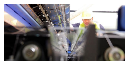
Strahlfallen befinden sich oberhalb und unterhalb der Laserlinie.