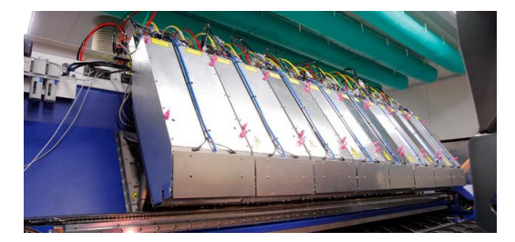
Die Boxen mit den Optiken sind in einer Brücke untergebracht, die die Förderstrecke überspannt.