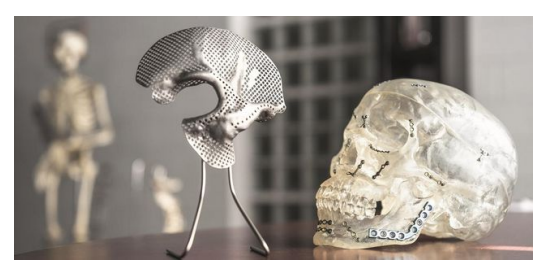
What the eye can't see: the surfaces 3D printing can produce are the key to promoting a connection between the bone and the implant.