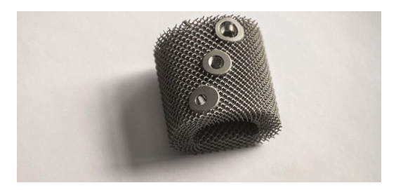
Prototype for 3D printed cages: for a long time, spinal fusion was the option of last resort for a herniated disc, but now 3D printed cages can restore vertebral segments to their natural height, allowing patients to return to pain-free mobility.

CONMET uses a Tru Print 1000 from TRUMPF to develop parameters and test different geometries and materials. "Our aim is to better understand all the processes involved," says Morozova. "That will enable us to produce custom-made, patient-specific implants and give us the groundwork we need to embark on full-scale production at the earliest possible stage." This is the second 3D printer from TRUMPF to be commissioned at CONMET. In early 2018, the company began using a TruPrint 1000 to make dental and craniomaxillofacial implants for cancer and traumatology patients. As well as the machine itself, TRUMPF also supplied the appropriate titanium powder, substrate plate, recoater tool and software. TRUMPF's high level of expertise and the overall success of the collaborative process were the deciding factors behind Dmitry Tetyukhin's decision to acquire the second printer. Morozova explains: "The TRUMPF experts in Ditzingen and their colleagues at the Moscow subsidiary offered us extensive support and advice to help us introduce the new technology and proved to be truly reliable partners. Their expertise played an invaluable role in the second project, too – for example when it came to determining the right parameters." CONMET plans to purchase a TruPrint 3000 to kick off full-scale production of its spinal implants.