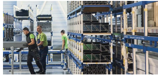
New solutions: to provide its custom facade solutions, KFK has to constantly think one step ahead and remain flexible at all times.