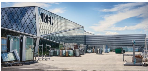
The KFK building in Croatia.