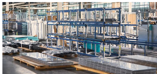
A one-stop service provider: KFK set up its own glass production facility measuring approximately 360 meters long in 2017.