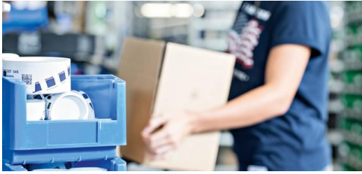
Packing: The person in charge of packaging is notified as soon as an order is complete.