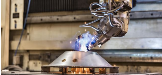
ELFIM uses the Lasercell 1005 for various applications of laser technology such as 2D and 3D cutting or welding and also for laser metal deposition.

And that's where the past and the present come together again in southern Italy: one of the first and still most important uses of the LMD process is to manufacture replacement parts for classic cars. Of course, there are no computer models for these. In such cases experts at ELFIM perform a 3D scan of an existing replacement part, make some modifications here and there, and so obtain a three-dimensional CAD model. This procedure is known as reverse engineering. For other commissions – such as the impeller – they receive a complete set of data ready for production.