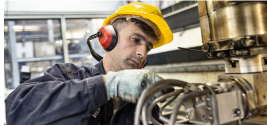
An employee prepares the Lasercell 1005.