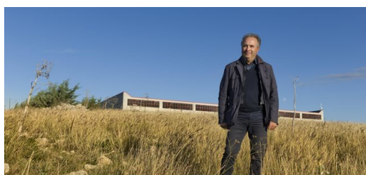
The company ELFIM s.r.l. is situated on a bleak and desolate limestone plateau near Gravina in Puglia.