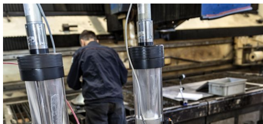
In combination with a powder feeder, the Lasercell 1005 from TRUMPF is also highly suitable for laser metal deposition.

“Strictly speaking, LMD is actually nothing new. It’s a process that has been used for many years now for repairs and coatings. However, we decided to use the process for manufacturing complete components – as is the case with this impeller here.”