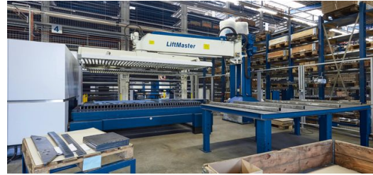
A Stopa storage system takes care of supplying materials while a LiftMaster makes it easier to handle parts.