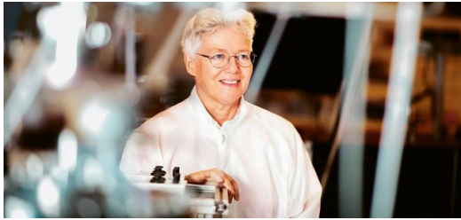
Professor Anne L'Huillier helped found the field of attosecond laser physics. This work may soon shine a light on the world of electrons.

L'Huillier: It's hard to give a well-defined vision. But that's how it is with basic research.