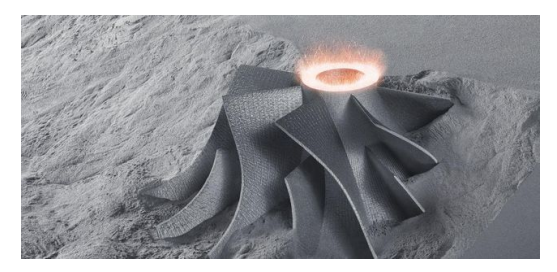
3D printing will become an important new manufacturing method leading to massive cost saving.