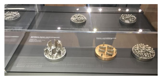
Substrate plates with 3D-printed dental prosthesis.