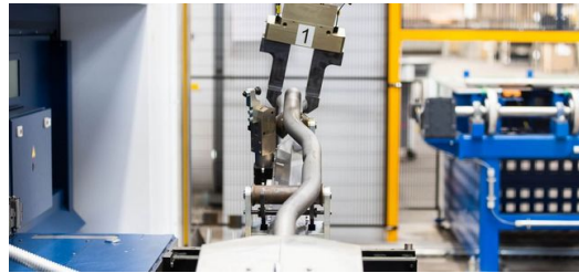
The systems in the machine network are automated by a robot system, which automatically transports the parts from one processing step to the next.