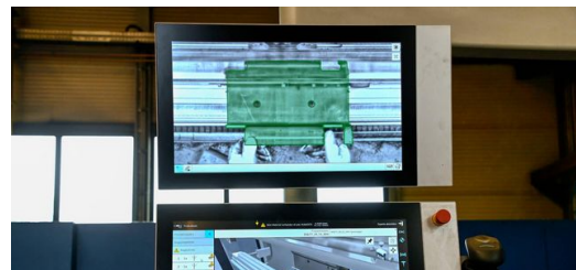
If the Part Indicator shows green, the bending part has been correctly positioned. Thanks to this function, Fischer Maschinenbau has been able to minimize scrap in their sheet metal processing and increase speed.