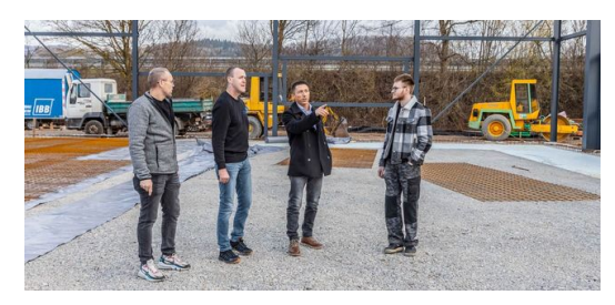
DELO is planning on relocating to neighboring Hechingen in September 2023. Construction work is in full swing. With a developed area of 2,000