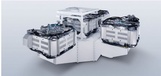
Since the beginning of 2014 TRUMPF has delivered its third-generation laser systems to ASML in Netherlands, the only manufacturer of EUV photolithography systems in the world.

Secondly, it is only the wavelength of 13.5 nanometers that makes it possible to manufacture the layer systems required for optical imaging at sufficiently high reflectivity. Refractive optical elements – such as lenses – absorb this wavelength. That is why EUV systems work exclusively with mirrored optical elements. The very short wavelength is also the reason why the entire process has to take place in a vacuum, since air would also absorb the EUV radiation.