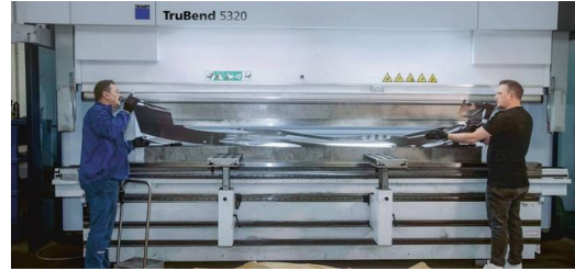
<p>Machine work: Engineers, artists and production workers learn from one another and develop a shared language.</p>