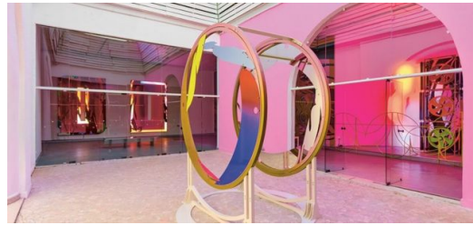
<p>The sculpture Superposed forms the centerpiece of the pavilion.</p>