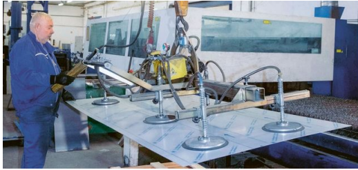
<p>Precision: Crafting artworks isn't a question of speed – it's about pushing the boundaries of what is technically achievable.</p>