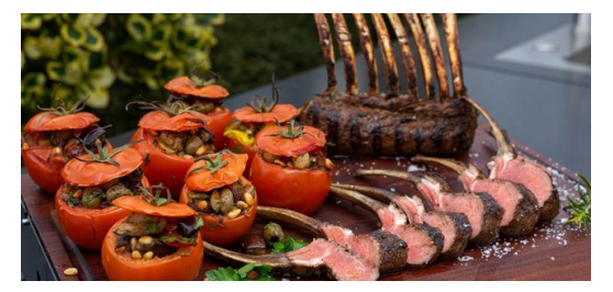
Irresistible: Create mouth-watering menus with charcoal and gas grills from Schickling.