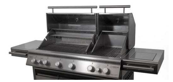
The fully equipped high-end BigRocket gas grill from Schickling gets all BBQ lovers fired up with excitement. Those who want to start with a basic model can retrofit it step-by-step with all the extras.