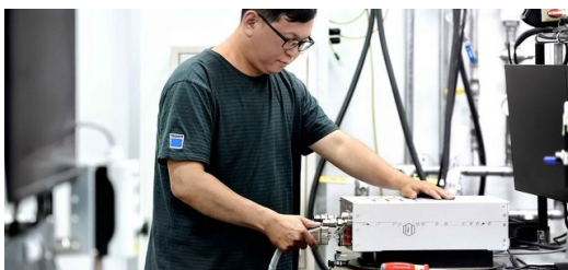
<p>Generators from TRUMPF tame the current and set the amperage, voltage and frequency to a highly precise value.</p>

The exposed areas are then etched away in a plasma process to create the finest conductor paths in the material. Here too, TRUMPF generators play an important role in controlling these complex etching processes.