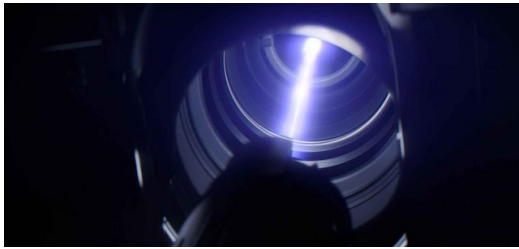
<p>Extreme ultraviolet (EUV) light draws the subsequent conductor paths as tiny patterns in the light-sensitive coating.</p>